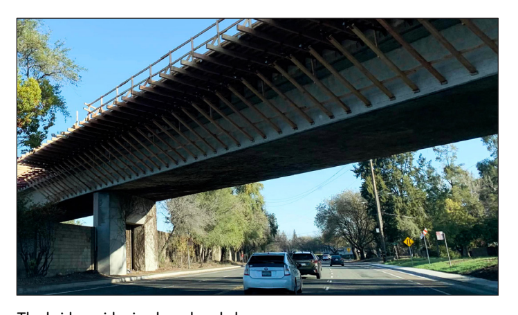
The bridge widening has already begun.