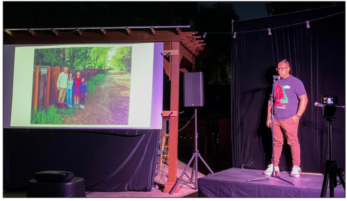
Phase 1 artists showcase.