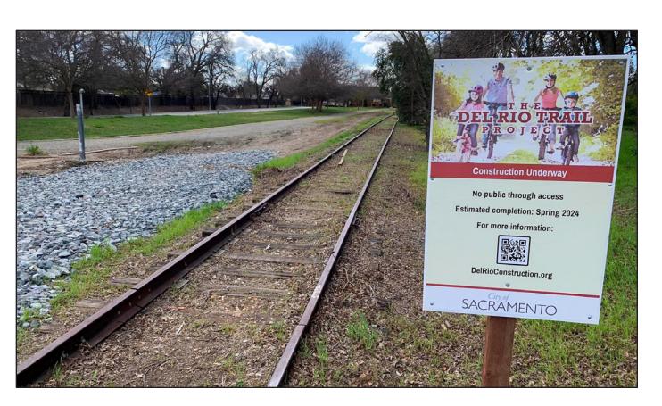
Signs announcing construction are up in the neighborhood.