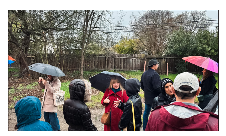
South Land Park neighbors and trail supporters enjoy a Walk & Talk on the future Del Rio Trail. The new trail will have less mud and more art.