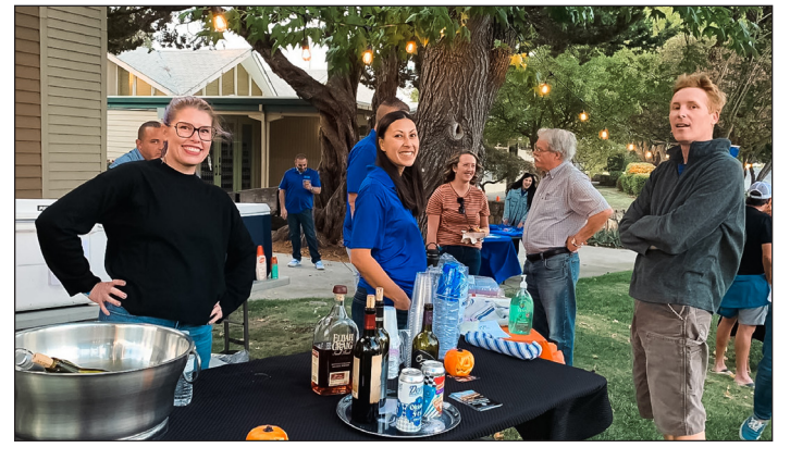
SLPNA volunteers taking a moment to smile at our Fall Mixer.