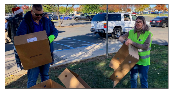
SLPNA was excited to help outgoing District 10 Assemblymember Jim Cooper give away over 1000 turkeys at the 2022 Annual Turkey Drive!